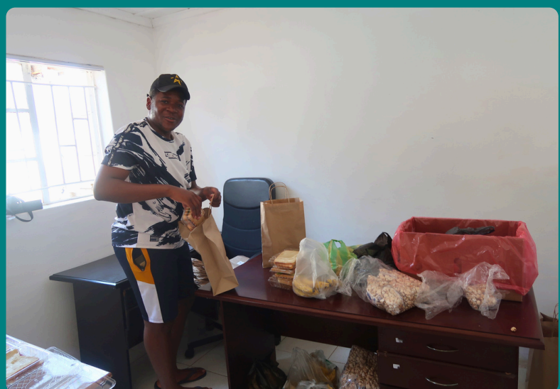
PhD fellows and volunteers prepare meals for the needy