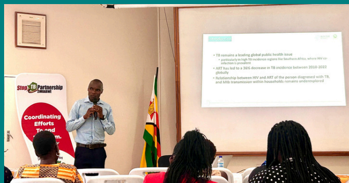
ERASE TB at the Zimbabwe National TB conference