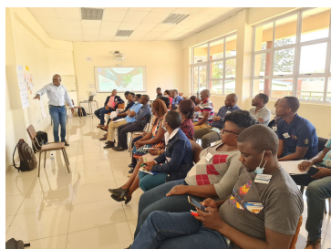
Adolescent engagement sessions