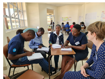
Adolescent engagement group work