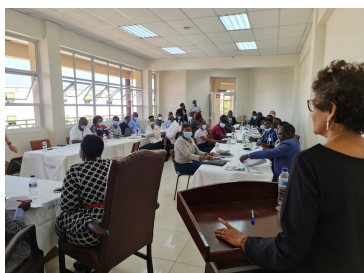
Introductions and panel discussion

The first in-person week of the second Empowering Professionals for the Wellbeing of Adolescents Programme for the Wellbeing of Adolescents Programme (EMPOWA) was held at the University of Zimbabwe (UZ) on the 12-15 September with 22 participants from various ministries and organisations in attendance. EMPOWA is designed to equip senior policy makers and programmers with knowledge and skills to improve their work on adolescent wellbeing. Participants were supported to develop a change project, which they will implement within their organisations over 12 months, with the end goal of improving adolescent wellbeing. One participant described EMPOWA as a, "Never-before-experienced rich and practical training program", another said that, "The programme is life changing indeed." The participants are beginning to implement their change projects, with support and feedback from four senior and four youth facilitators, and their supervisors in their organisation. The second in-person week will be held from 10-14 October at UZ.