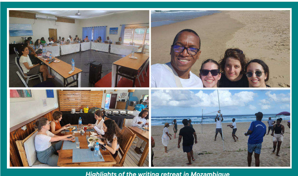
Highlights of the writing retreat in Mozambique