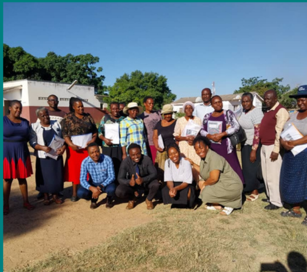
Training of COM-BP Facilitators in Chitungwiza