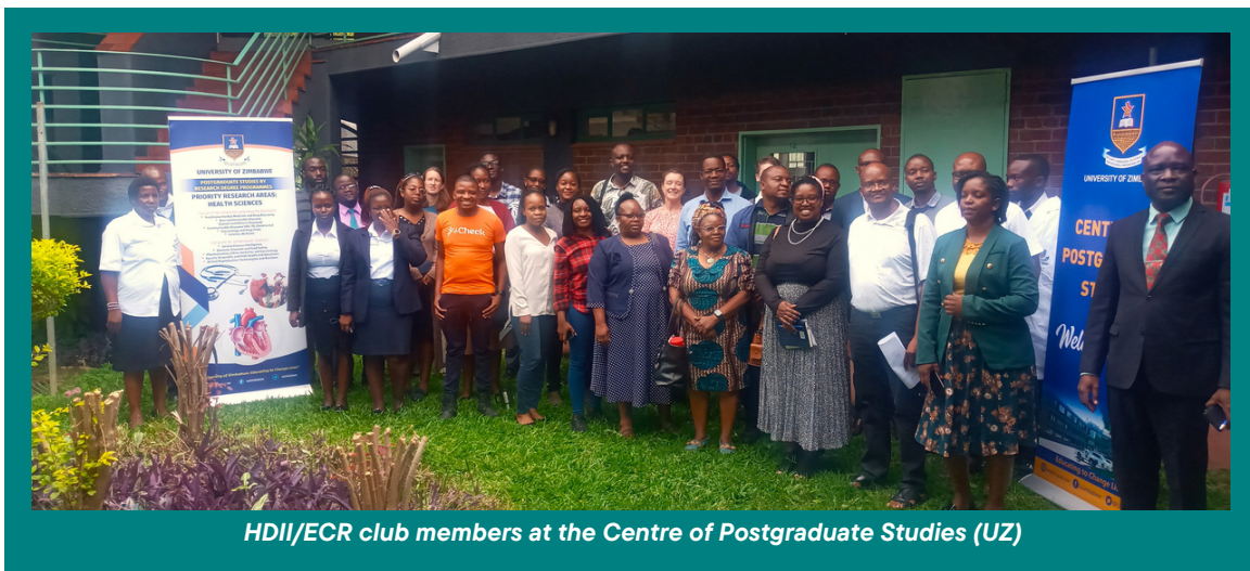
HDII/ECR club members at the Centre of Postgraduate Studies (UZ)