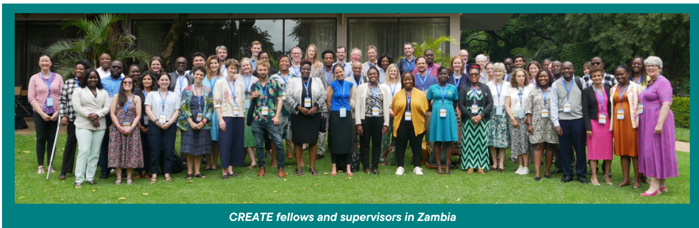
CREATE fellows and supervisors in Zambia