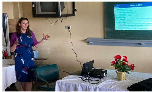
Neotree site visits and dinner event